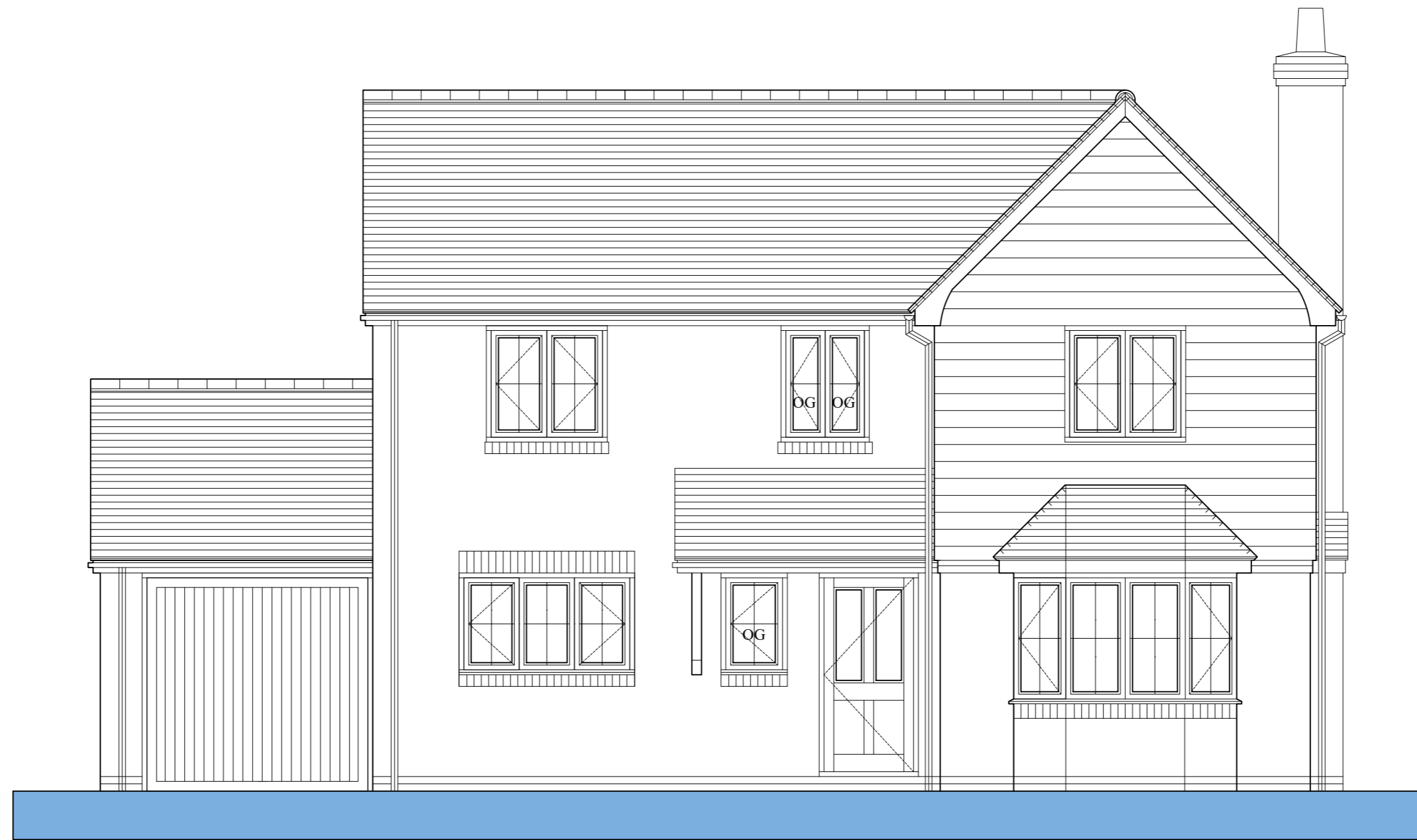
FRONT WEST ELEVATION