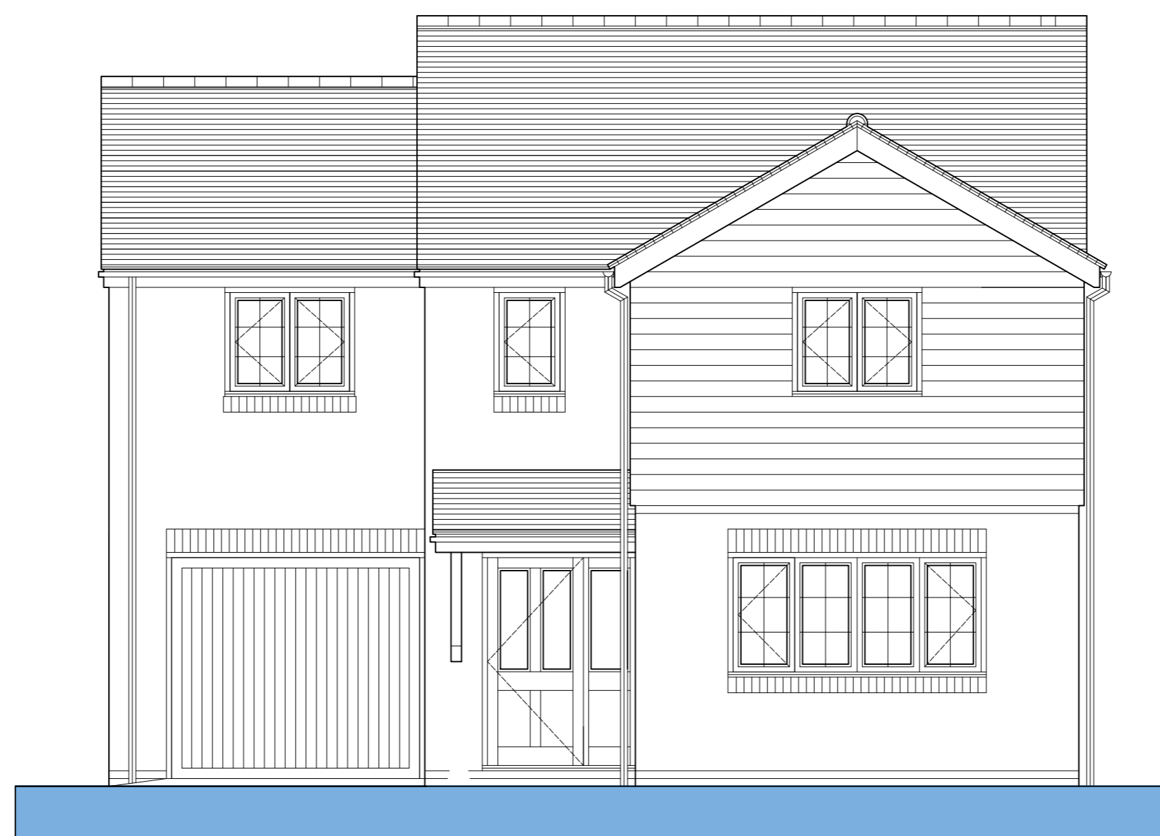
FRONT EAST ELEVATION