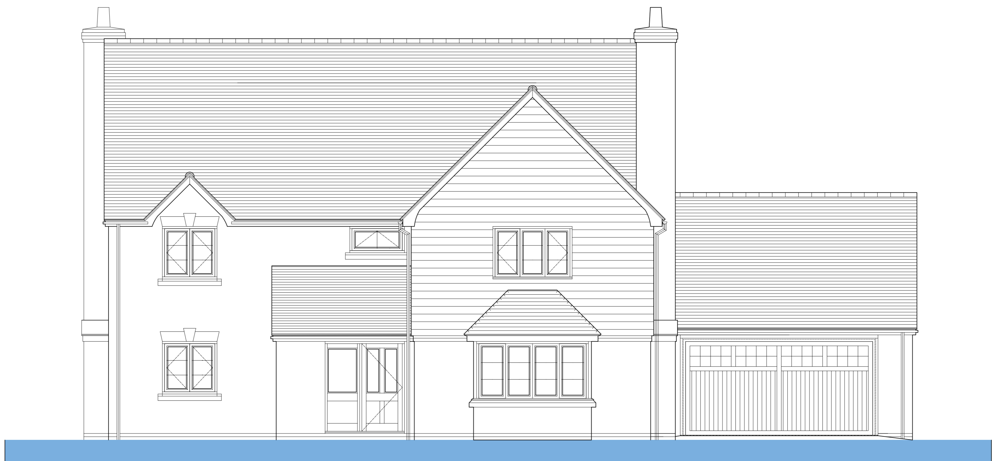
FRONT SOUTH ELEVATION