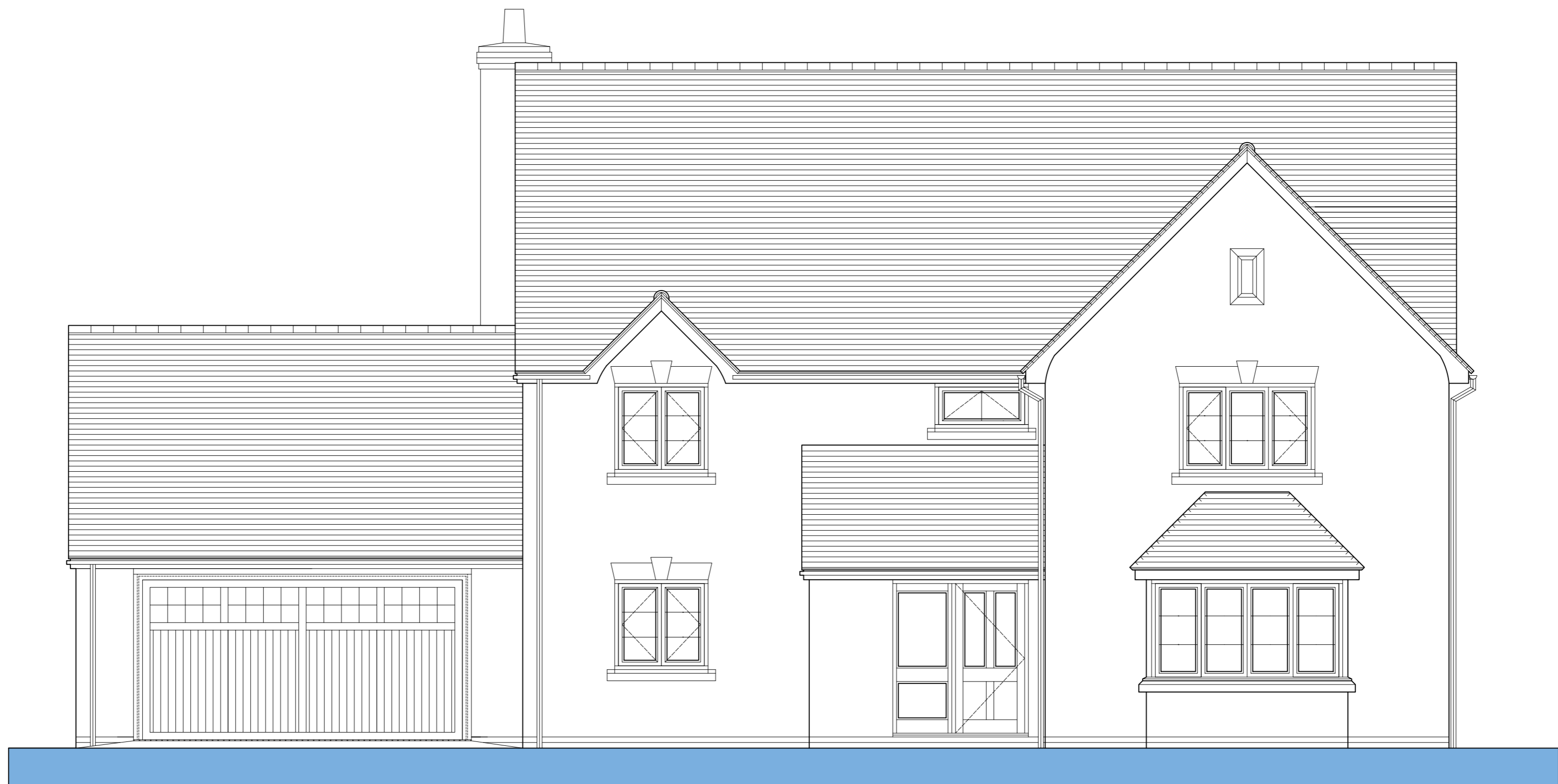
FRONT SOUTH EAST ELEVATION